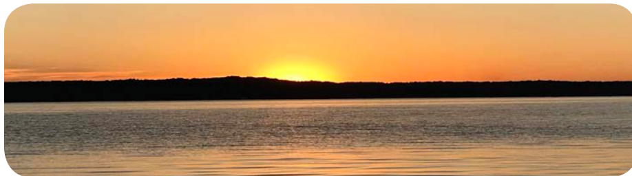
► A beautiful sunset over a body of water that would not normally exist. This is where the Nutwood levee was breached, and fields were flooded.

Our prayers and thoughts go out to those who have been affected by the devastating flood waters. We share the frustration that our Members are experiencing during these difficult times. Safety has been MJM's biggest concern and it is nearly impossible to get to many of these locations due to the high water and road conditions. Please have patience with us during these challenging times.